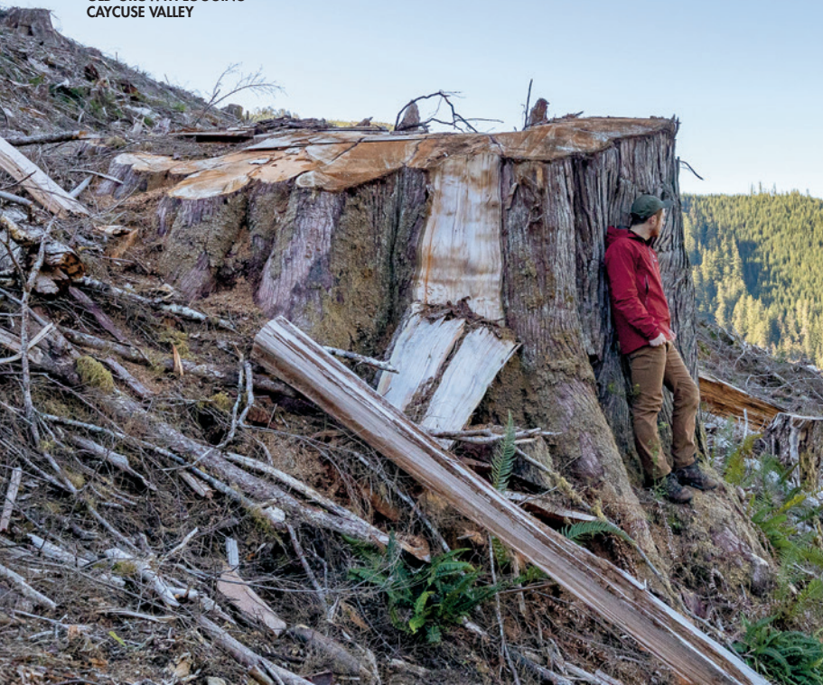
BEFORE & AFTER OLD-GROWTH LOGGING CAYCUSE VALLEY